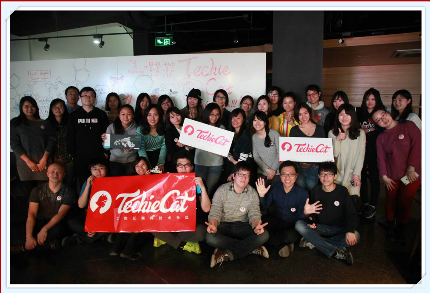
First Off-line Event 2015.3.7 Beijing